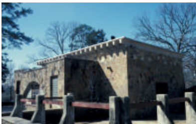
Elephant House at the Little Rock Zoo