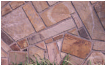
Artistic coursing by Owens

The stone would be sorted at the site with an eye toward size, color and form requirements. Once it was sorted, Owens would use a flat chisel called a blocking tool