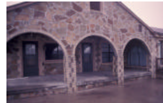
Mediterranean style arcades

The Mixed Masonry as an architectural form exhibited elements of the national trends of the day. The Craftsman style with its three-or four-over-one Craftsman sash windows, open rafter tails and gabled porch is the most common influence in these buildings. Silas Owens, Sr., favored the use of arcades on his porches, which introduced a graceful Mediterranean touch to an otherwise basic bungalow. The 1950s study on Southern farm housing preferences revealed that front and back porches for work and recreation were considered essential features in a farmhouse. The presence of a side porch was noted as an indicator of higher socioeconomic status. Two surviving Silas Owens, Sr., Mixed Masonries feature a side porch, (Walt Tyler House, FA1298, Fred and Ethel Hobbs House, FA1332) and a few were constructed with wraparound porches, providing shade and extended shelter to the side elevation in this manner. The English Revival style could be detected in Owens' work through the use of prominent front gables and whimsical, front-facing, exterior chimneys. The ever present quoins of brick added a Georgian or Colonial Revival touch to his vernacular designs, as did the mid-to-late 1940s use of six-over-six windows. Some late 1940s and early 1950s examples were