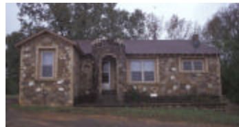
French Eclectic Mixed Masonry in Danville

The buildings were constructed for religious, commercial and residential purposes and were modest, unassuming, predominately one-story structures. These Mixed Masonries exhibit a variety of architectural influences within a vernacular adaptation. Associated styles include Craftsman, English Revival, Mediterranean and Ranch as well as one known example in Yell County constructed in a restrained French Eclectic style. The Mediterranean style can be seen in the frequent use of arcaded porches and the utilization of a brick quoin treatment on the building corners can be linked to a variety of high-style influences such as Georgian, Italianate and Colonial Revival.