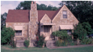
English Revival Mixed Masonry, Damascus