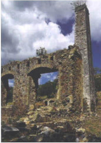
in, St. Croix

Two interesting occurrences of the earlier use of cream brick reminiscent of the Mixed Masonry have been noted. These examples are located at a great geographic distance from Arkansas, but they should not be ruled out as possible influences. It is not