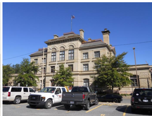
Post Office & Courthouse, 2015