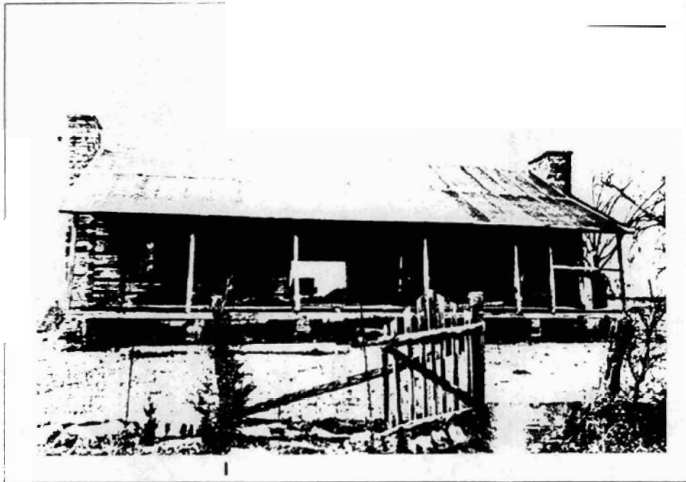
Historic Resources of Stone County Zachariah Ford House, ST-41 Pleasant Grove vicinity 1983 Negative on file at the AHPP Viewed form the north