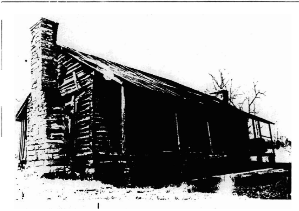
Historic Resources of Stone County Zachariah Ford House, ST-41 Pleasant Grove vicinity Viewed from the northeast