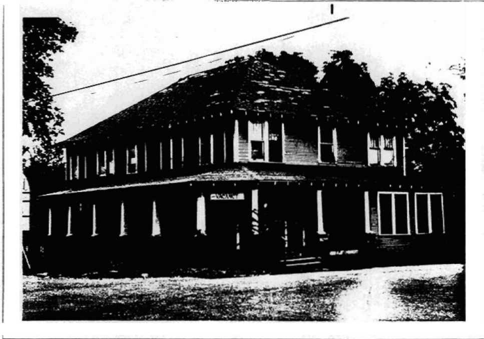
Historic Resources of Stone County Commercial Hotel, ST-94 Mountain View Don Brown, photographer 1983 Negative on file at the AHPP Viewed from the southwest