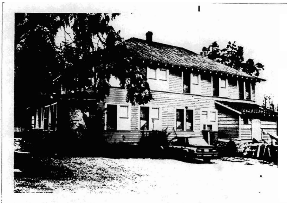
Historic Resources of Stone County Commercial Hotel, ST-94 Mountain View Don Brown, photographer 1983 Negative on file at the AHPP Viewed from the southeast