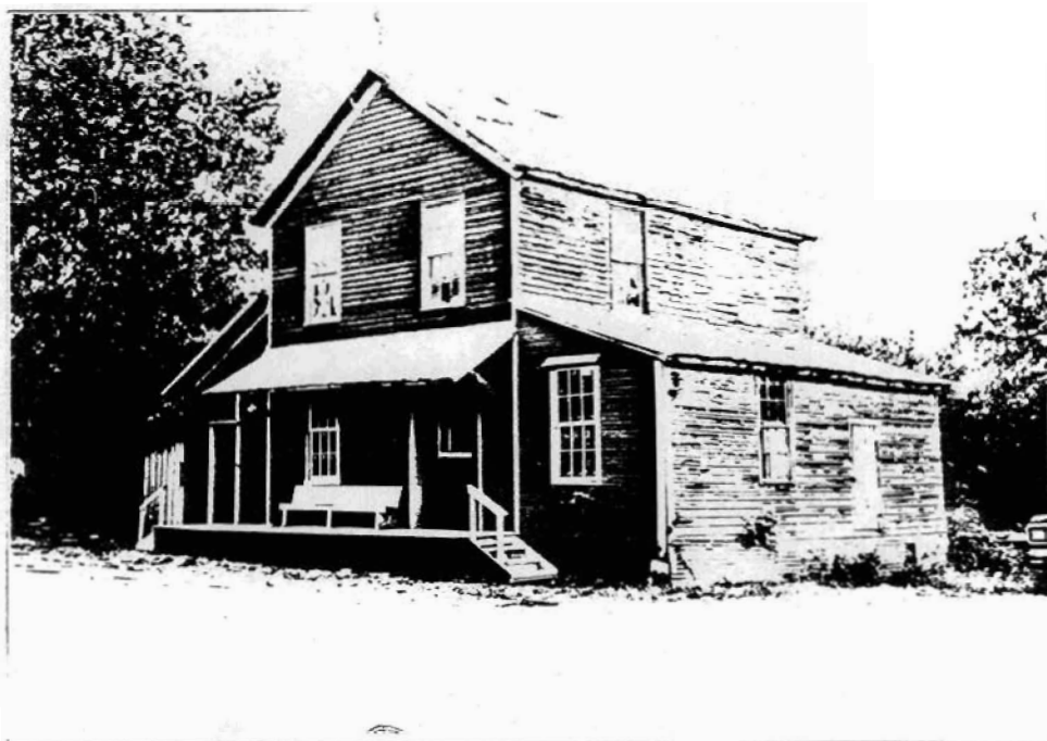
Historic Resources of Stone County Brewer's Mill, ST-112 Mountain View Viewed from the northwest