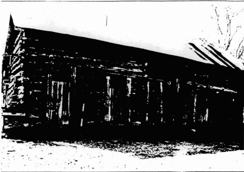
Historic Resources of Stone County William Dillard Homestead, ST-128 Round Bottom 1983 Negative on file at the AHPP Viewed from the east