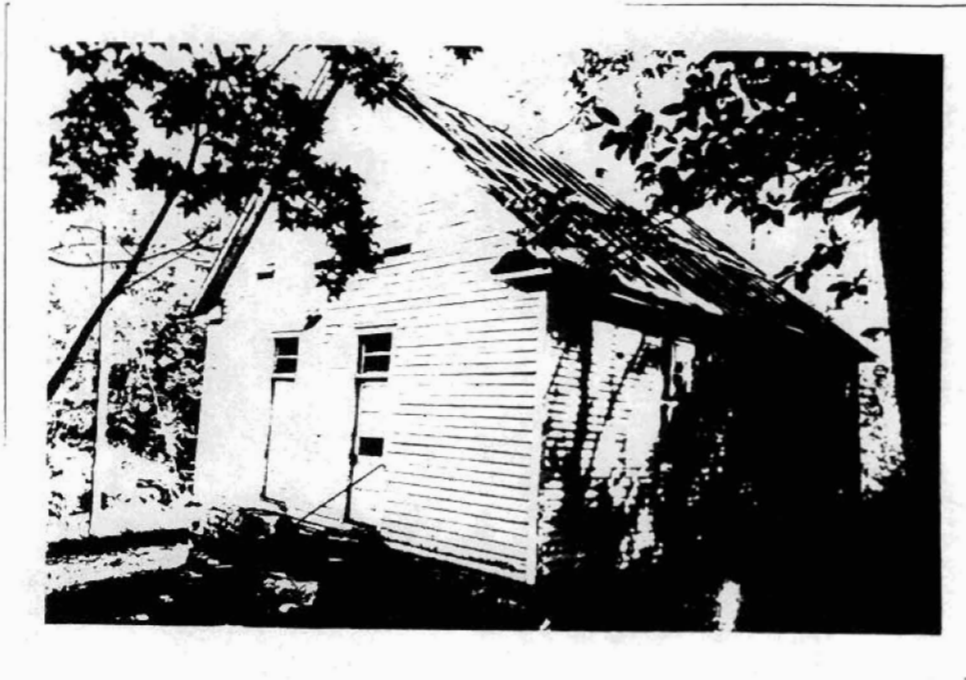
Historic Resources of Stone County Roasting Ear Church & School, ST-185 Onia vicinity 1983 Negative on file at the AHPP Viewed from the northwest