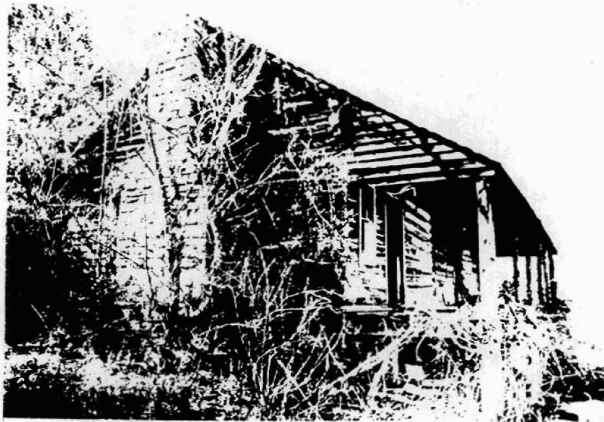
Historic Resources of Stone County George Anderson House, ST-192 Big Springs vicinity 1983 Negative on file at the AHPP Viewed from the east