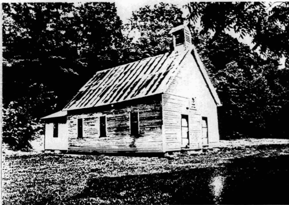
Historic Resources of Stone County Bluff Springs Church & School, ST-215 Landis vicinity 1983 Negative on file at the AHPP Viewed from the southwest