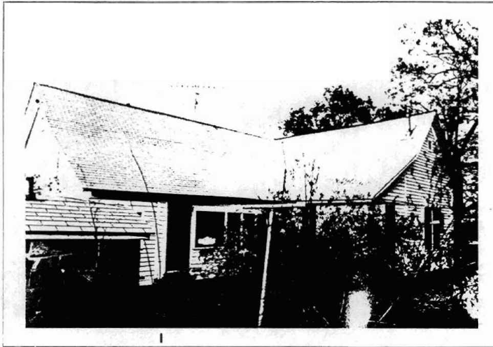
Historic Resources of Stone County Henry Copeland House, ST-36 Pleasant Grove Negative on file at the AHPP Viewed from the southeast