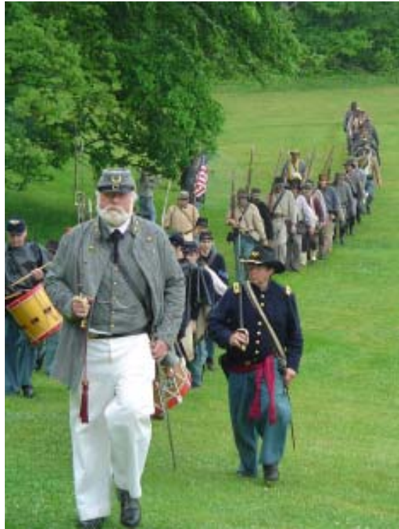
Reenactors participate in NEACWHT event at Chalk Bluff battlefield.

We should be able to complete the Martin's Creek/Morgan Mill marker this year. We are waiting on the estimate from the marker manufacturers at this