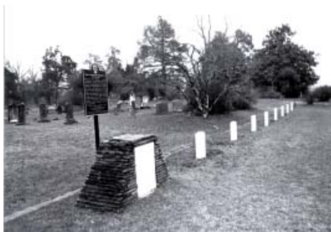
The Confederate Section, Old Rondo Cemetery contains the remains of Texas soldiers who died of disease while camped in the area in 1862.

"While they never witnessed a shot fired in anger, the network Continued on Page 5.